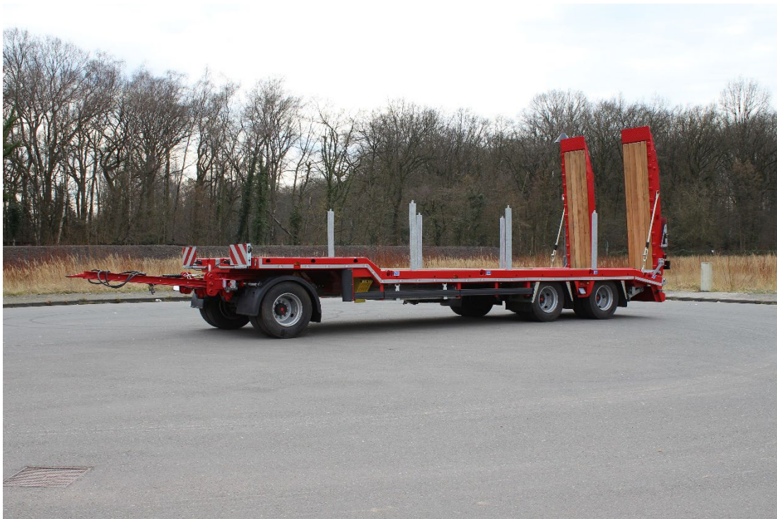
Photo 2: The TÛ 30 is the universal implement for transporting many machines in construction companies.